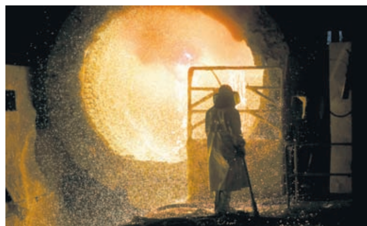
In this Tuesday, March 5, 2019, file photo, an employee in protective clothing works with a steel pouring ladle during a guided media tour at the steel producer Salzgitter AG in Salzgitter.